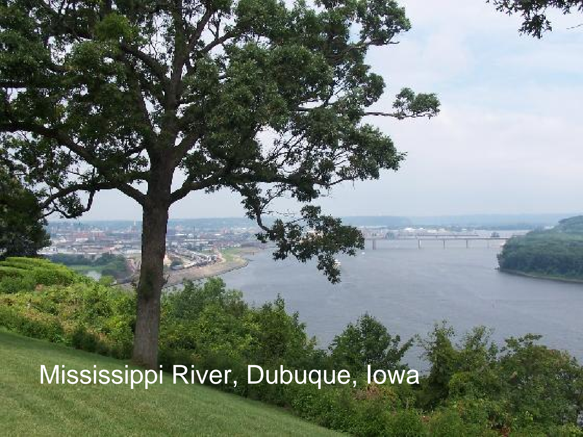
Mississippi River, Dubuque, Iowa