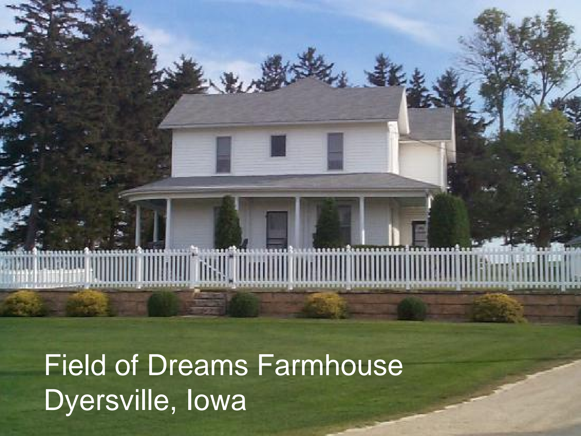
Field of Dreams Farmhouse Dyersville, Iowa