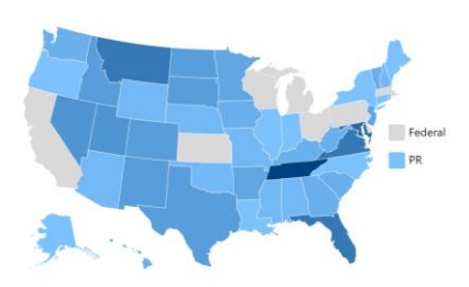
FSMB Legislative Tracker