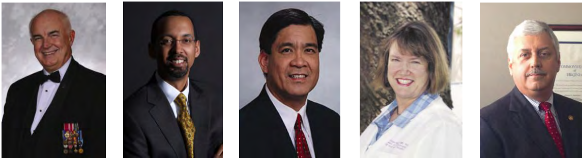
(pictured left to right as listed below)

The following individuals were elected to the FSMB Board of Directors: